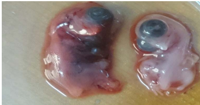
Figure 2: Lesion on dead embryos chicken egg 48hr after inoculated with virulent Newcastle virus (A) infected embryo (B) control