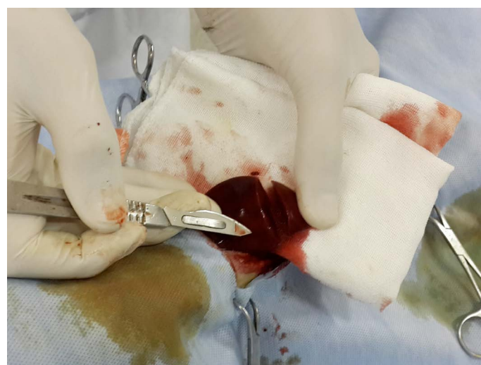
Figure 1: Induced hepatic wound in the caudate lobe of the liver

The dogs were initially sedated by intravenous injection of 1mg/kg xylazine HCl ( Xylaject 2%, ADWIA, Egypt ), and then anesthetized by ketamine HCl 10mg/kg ( Ketamax-50, Troikaa Pharmaceuticals Ltd., India ), and surgically prepared. Thereafter, a ventral midline laparotomy incision was made and the caudate lobe of the liver was extracted from the abdominal cavity. Next, a 3-4 cm incision with 1/2 cm depth was made on the caudate lobe of the liver by a scalpel and the depth was determined by a mark made on the scalpel 1/2 cm from the tip, and the length was measured with a ruler on the liver as described in (Figure 1).