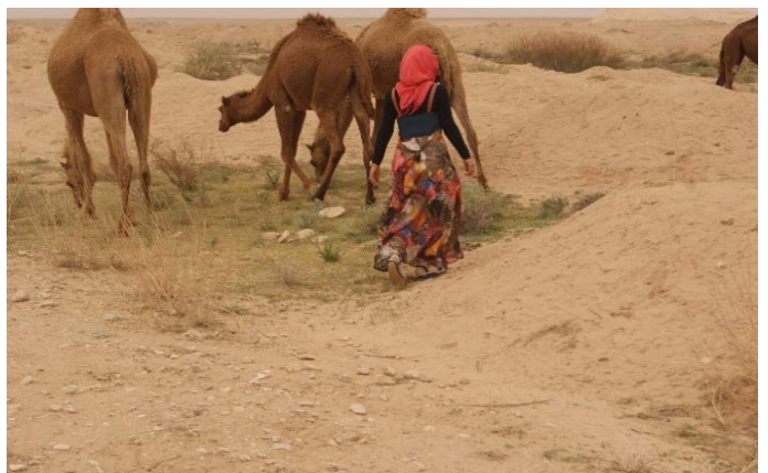
Figure 5: Shows the natural desert plants and herd of camels