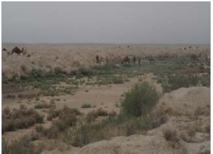
Figure 4: Shows the herd of camels in Wadi Kharaza

Despite, the fact that camels do not compete other animals on pasture because they are highly resistant to diseases and drought conditions. However, In last decades, the global warming, climate changes, drought and scarcity of rainfall in Iraq in general and in Al Muthanna province in specific, reflect on the growth of natural desert plants. These factors affect on the feeding and grazing of the camelids moreover, the poor education of the camels owner to provide the alternative fodder for their animals led to reduce the milk and and meat production especial in the last two years. Moreover, the absence of governorate support for the camels owner led to affect negatively on the breeding of the camel because of the fluctuating of food availability in Al Muthanna province. Meanwhile, in some years, the local province government are provided breeders with 20 -25 kilos per head / year depending on the availability of the appropriate quantity.