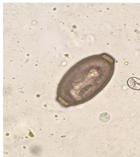
Figure 9: Trichuris spp. egg

Out of the 839 live-captured rodents over the study period, a total of 174 (20.74%) was assessed with positive of endoparasites. The Cysticercus fasciolaris (Figure 6), the larval form of Taenia taeniaeformis (Figure 7a & 7b) cestode parasite of cats, was the predominant endoparasites identified with 115 (13.7%) and followed by Syphacia spp and Hymenolepis nana & Hymenolepis diminuta with respectively 68 (8.1%) and 9 (1.07%) as number of infested live-captured rodents (Figure 8a, 8b and 8c). In addition, only 4 live-captured rodents were infested with Trichuris spp. egg or whole worm (Figure 9) whereas only one was infested with trematodes.