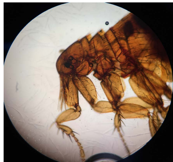
Figure 1: Xenopsylla cheopis (Oriental rat flea-Male)

Three species of fleas were identified, Xenopsylla cheopis (Oriental rat flea) (Figure 1) was the prominent species detected in rats. Most of isolated fleas were on the brown rat. Besides, we were able to identify two other species of fleas, Ctenocephalides felis (Cat flea) (Figure 2) and Echidnophaga gallinacean (Sticktight Flea) (Figure 3). Their percentages were exceedingly less than the former one.