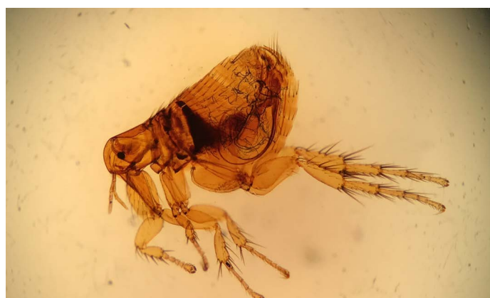
Figure 3: Echinophaga gallinacean (Hen Flea)

The mites identified were belonging to genus Ornithonyssus spp (Tropical rat mites) (Figure 4).