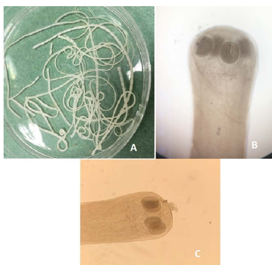
Figure 8: A) Hymenolepis nana whole worm extracted from small intestine of brown rats; B) Hymenolepis nana (Head suckers); C) Hymenolepis diminuta (Head scolex)