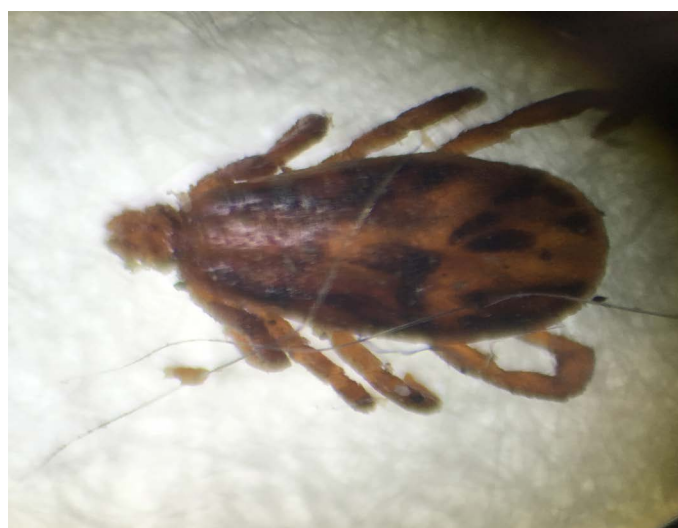
Figure 5: Ixodidae (Hard ticks)

The number of ticks isolated was very scarce among the whole span of the study. The main species of ticks isolated was belonging to family Ixodidae (Hard ticks) (Figure 5).