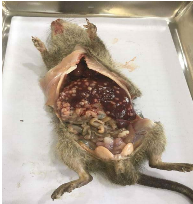
Figure 6: Cysticercus fasciolaris , heavy infestation in brown rats liver