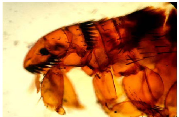
Figure 2: Ctenocephalides felis (Cat flea)