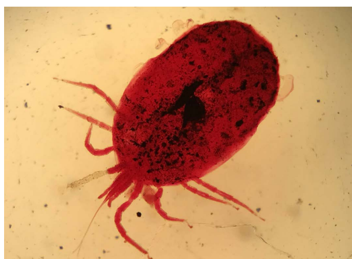
Figure 4: Ornithonyssus spp (Tropical rat mites)

The mites identified were belonging to genus Ornithonyssus spp (Tropical rat mites) (Figure 4).