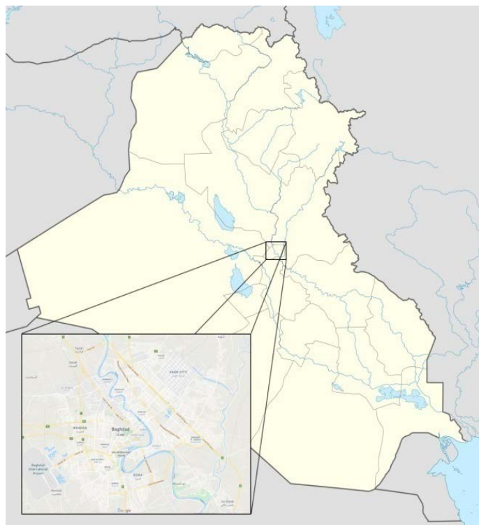
Figure 1: Map of Iraq showing the situation of Baghdad city in central Iraq.

Baghdad city is the capital of the Republic of Iraq, located in the Tigris alluvial plain in central Iraq and lies on 39 m asl. The coordinates are: 33° 18' 46.0980" N and 44° 21' 41.3568" E (Figure 1). Its climate is generally hot and arid receiving 100-175 mm of rain annually between November and March. The temperature touches 50°C during the summer. According to (NCCI, 2015) average high temperatures: 15.5°C (January) to 44°C (July), and average low temperatures: 3.8°C (January) to 25.5°C (July). The mean annual temperature of Baghdad city is 22.6 °C. This climate is considered to be a hot desert climate (BWh) (Figure 2) according to the classification of Köppen-Geiger (Climate-Data.org, 2019).