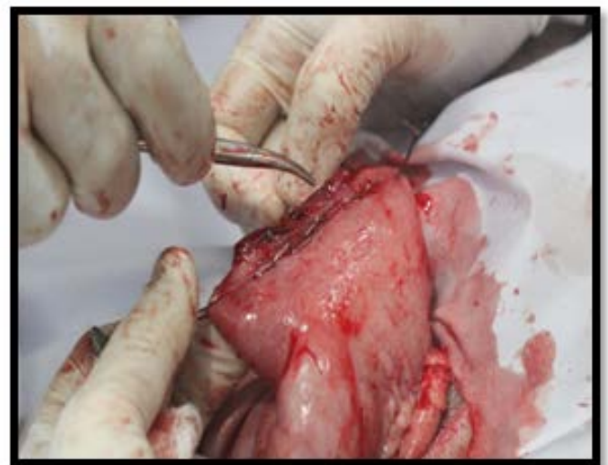
Figure 4: Stapling Suture Closure View