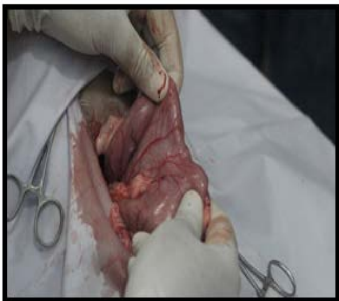
Figure 1: Gastrostomy Incision Site