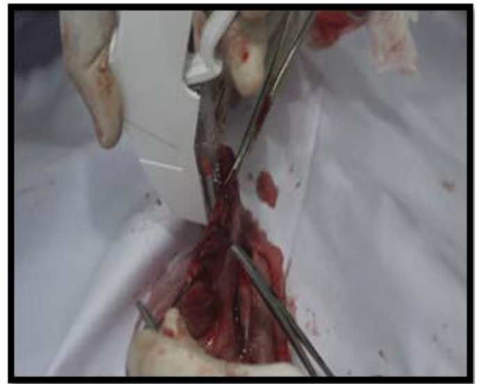
Figure 3: Stapling for Gastrostomy Incision Closure.