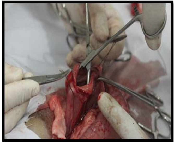
Figure 2: Gastrostomy Incision

The results from the contrast radiography showed that there was no leakage in any group till day 5 post-operation. In group B leakage in one dog was present at day 5 which later died. In group C, one animal showed leakage at day 7 post-operation and the dog expired due to blood loss and peritonitis. In group A, all dogs remained fine.