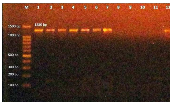
Figure 1: Amplification products of C. bovis was analyzed by electrophoresis on a 1.5% agarose gel. Lane M: 100-bp DNA ladder, lane (1-2-3-4-5-6-7-12): positive at size 1250 bp. Lane (8-9-10-11): negative.

In the present study, 35 isolates of Corynebacteria spp. were inspected using PCR with 16S rRNA gene, which is a primer specific for C. bovis . The result showed 8 positive strains of C. bovis out of 35 (22.8%) tested samples (Table 3) with a target PCR amplicon size of 1250 bp (Figure 1, Table 1).