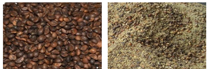
Biji kangkong kualitas bagus (Mangkoko, 2015)

Land spinach seeds used in this study originated from a local seed factory. The seeds then dried under the sun for 3 days or until the weight was constant. Dried seed then grounded with a disk mill machine to produce the kangkong seed meal (KS) (0.87 mm in diameter in average) (Benedetti et al., 2011) (Figure 1).