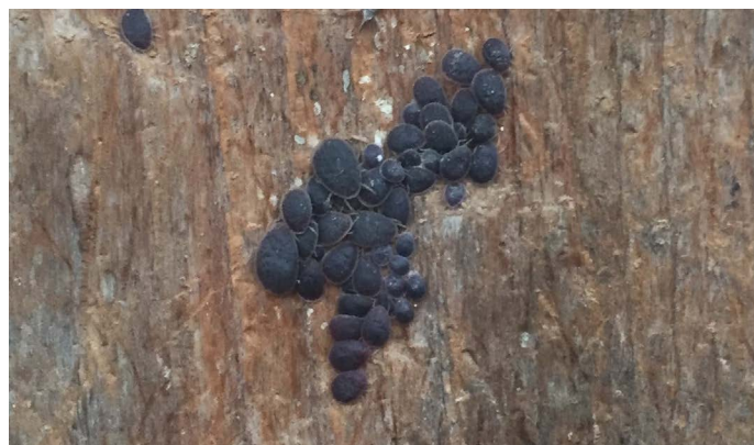
Figure 4: Clustered engorged ticks in hiding places

At the end of every week, pens were opened and cleaned. Ticks were found hiding in the traps and clustered in the roof and corners of the hiding places (the wooden boxes) inside the pens (Figure 4). All different life stages of A. persicus were collected and then grouped to estimate the population of ticks on days 7, 14, 21, 28.