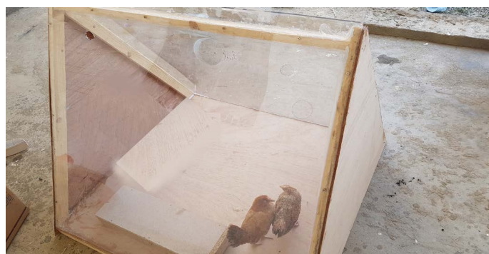
Figure 1: Special pens made for the experiment

Four isolated chicken pens measuring 120 cm × 120 cm × 100 cm were placed in the room of infested groups. Pens were made of wood and transparent thick plastic walls for better viewing and observation during the day and night. All building materials of the pens were fixed with nails and sealed securely with silicon glue. Each pen was supported with ceiling ventilation to control air and temperature inside the pens (Figure 1). There were also hiding places inside each pen providing the right shelter for ticks to hide after receiving a blood meal from the host during the night. Each hiding place was made of a wooden box sized 50 cm × 20 cm × 10 cm and opened from the base. Moreover, tick traps were made of cardboard size 10 cm × 7 cm × 4 mm and fixed inside the hiding places (Figure 2). The traps inside the hiding places help to evaluate the intensity of infestation and to estimate the tick population every week.