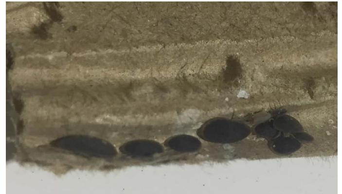
Figure 2: Ticks inside tick traps

Rooms were supported with air conditioning and fans to maintain the temperature at 30 ± 5 °C and relative humidity (RH) at 35 ± 5% (Hafez et al., 1972; Hassanali et al., 1989; González-Acuña et al., 2010). The light was provided by two LED 40W light bulbs and kept on for about 14 hours a day in each room. The hens were fed (Fakieh Feed by Fakieh Group, Jeddah, Saudi Arabia) commercial poultry feed, purchased from a local market consisting of 58% maize, 35% soybean, 1.5% limestone, 1.5% calcium and phosphorus, 1% vitamin, 1% mineral salts, and 2% vegetable oils. Water was provided directly from the tap.