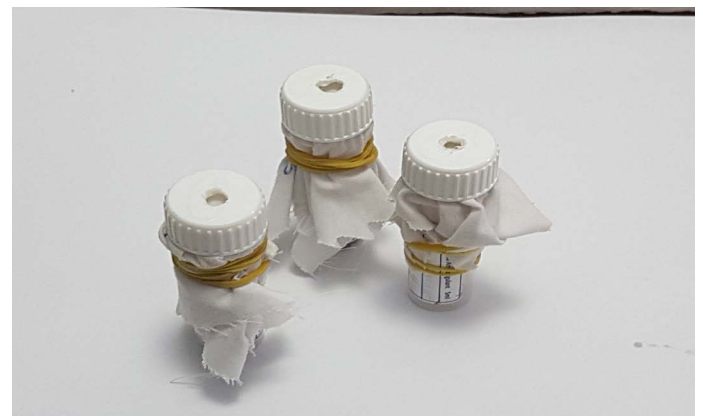
Figure 3: Rearing tubes

The ticks of A. persicus used in this study were collected from several local poultry farms in Jeddah Governorate, Saudi Arabia. They were identified using tick identification key (Walker et al., 2003). These ticks were found in the cracks, crevices, below the feed trough, on birds and in the chicken house. They were also trapped using cardboard tick traps (Figure 2). Ticks were saved in isolated rearing tubes (tubes with a small hole in every stopper) that will be a house to store live ticks. Holes must be covered with small pieces of white clothes from inside the tube and should be secured with any fitting rubber (Figure 3). Plug holes allow necessary ventilation and the fabric for preventing larvae from escaping outside the bottle while letting the air inside the bottles.