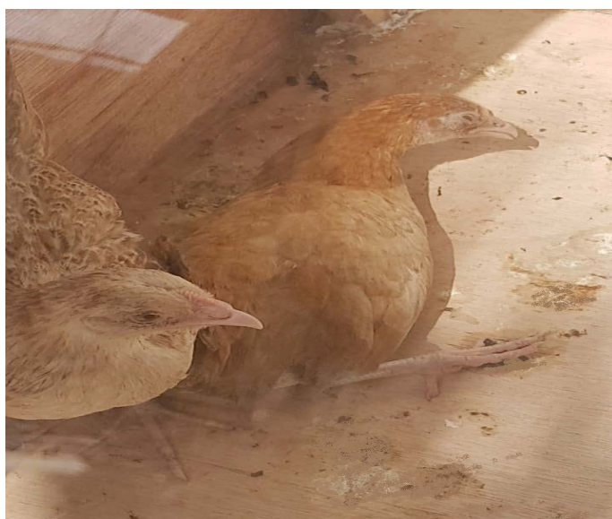
Figure 6: Infested birds are weak and inactive

three. The two previous sick birds in week 2 were found dead in week 3 (day 16 and 20). By the end of week four, 9 additional infested birds were found dead. They were already suffering from anemia, low body weight, losing appetite and general weakness. It was decided to terminate the experiment by the end of week 4 for several reasons. The increase in mortality specifically in week 4 made it difficult to continue with less than 50% of infested groups against the increasing population of A. persicus . For example, groups B and C were left with only two samples in each group at the end of week 4. The hens survived in the infested groups were weak, tired, inactive, and anemic (Figure 6). It was very difficult to collect sufficient volume of blood samples especially in week 4. Most blood samples collected in week 3 and 4 were clotted and didn't show the accurate hematological results.