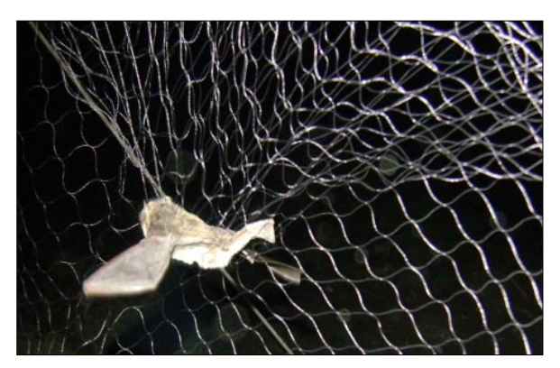
Figure 1: Captured bat in mist net used in this study

reverse primers. After preparing the reaction mix, PCR reaction was completed by 45 cycles after initial denature 94°C for 4 minute followed by denaturation 94°C for 45 second, annealing at 45°C 90 second and, extension at 72 °C for 2 minute. The RT–PCR products were examined by gel electrophoresis as recommended by David et al. (2002).