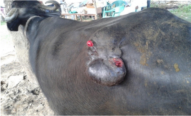
Figure 1: Ulcerated swelling on the left lateral angle of ilium in a buffalo

by daily dressing of wound 1% povidone iodine solution. Gamma benzene hexachloride ointment was used as fly repellent. Skin sutures were removed on 10th day post-operative. The animal had uneventful recovery without any complications. No recurrence was reported after surgery for a period of six months.