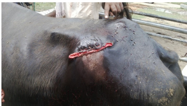
Figure 3: Skin closure after the excision of tumour mass

Histological sections (H & E staining) of the tumour mass revealed multifocal, large round to polygonal cells with round nuclei and abundant cytoplasm indicating histiocytes, along with few multinucleated forms (Figure 4). Based on cytological and histopathological examination the tumour mass was diagnosed as malignant histiocytosis.