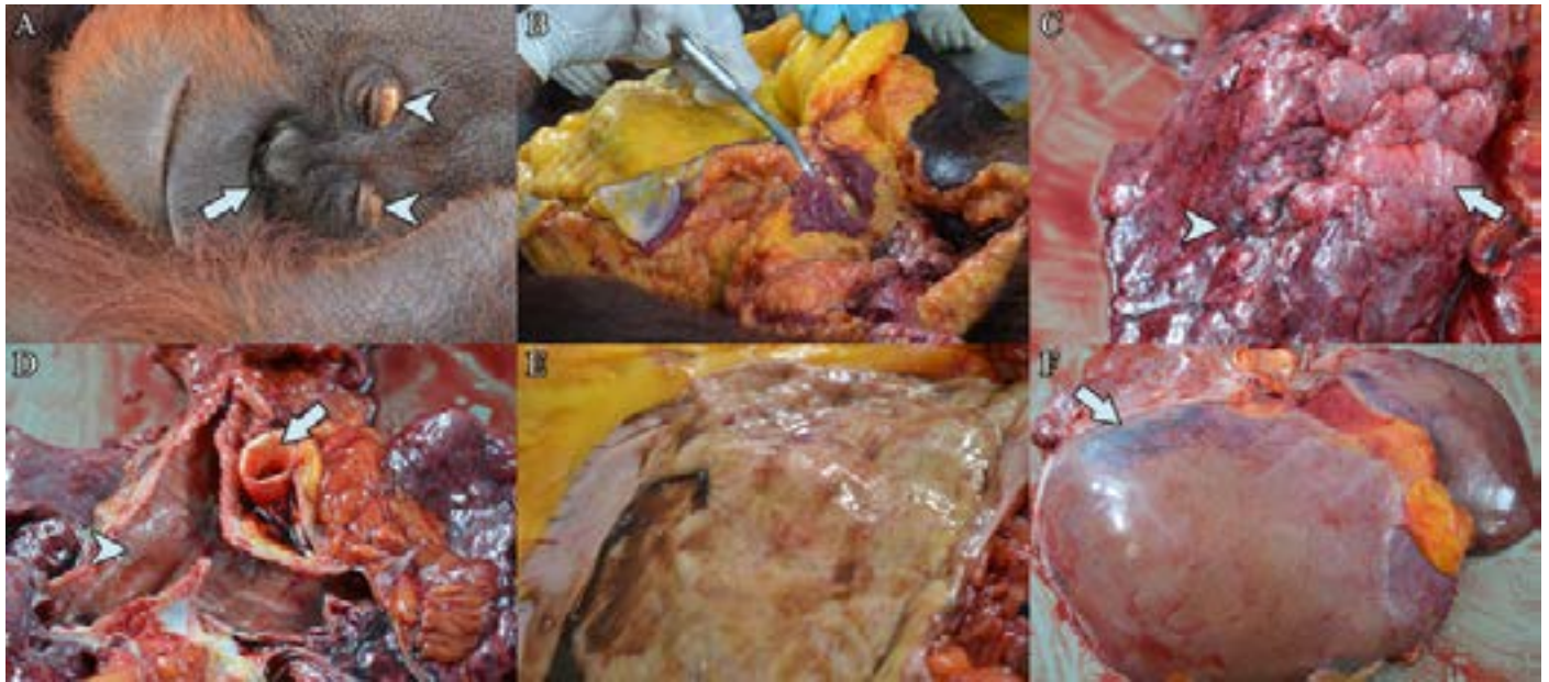
Figure 1: (a) Bilateral dried haemorrhagic nasal discharge (arrow), with bilateral yellowing of the eyelid (arrow heads). (b) Severe jaundice of the subcutaneous and visceral fat. (c) Pulmonary emphysema (arrow), with areas of pulmonary petechiation (arrow head). (d) Yellowing of the aorta (arrow) with presence of frothy serosanguineous exudate along the congested trachea (arrow head). (e) Mild haemorrhage on the stomach mucosa. (f) Yellow discoloration and generalised hepatomegaly, with hepatic haemorrhage (arrow)

haemorrhagic nasal discharge was observed (Figure 1a) with severe jaundice of the subcutaneous and visceral adipose tissues (Figure 1b). In the respiratory tract, severe pulmonary oedema was observed in the trachea and lungs (Figure 1c). Pulmonary petechiation and focal emphysema was observed on the left lung lobe. No gross lesion was noted upon examination of the heart. The tunica intima of the aorta was severely jaundiced (Figure 1d). The stomach and intestine were empty, with haemorrhagic gastroenteritis (Figure 1e). Mild hepatic lipidosis, generalised hepatomegaly with sub-capsular hepatic haemorrhages was observed (Figure 1f). Samples of lungs, liver, kidneys, spleen, and heart were collected for histopathology and bacterial isolation and identification.